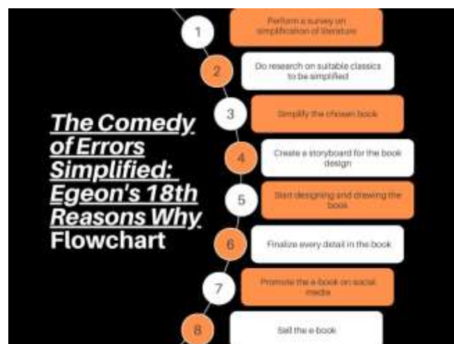
Figure 1: The Comedy of Errors Simplified: Egeon's 18th Reasons Why flowchart.

The goal of The Comedy of Errors Simplified: Egeon's 18th Reasons Why is to write a book that will be able to summarize numerous outstanding literary works for a larger audience. As a result, many more people will be able to enjoy reading a variety of classics without needing a deep understanding of literature, which is essential because reading classical literature can be more challenging than reading modern books. When considered in context, the words and imagery utilized differ greatly from those of modern times. A questionnaire was distributed before the author began constructing the project to help choose the key elements to focus on in the book. The Results and Discussion portion of this paper contains a discussion of the findings. The flowchart below was used to create the e-book and the general procedure used.