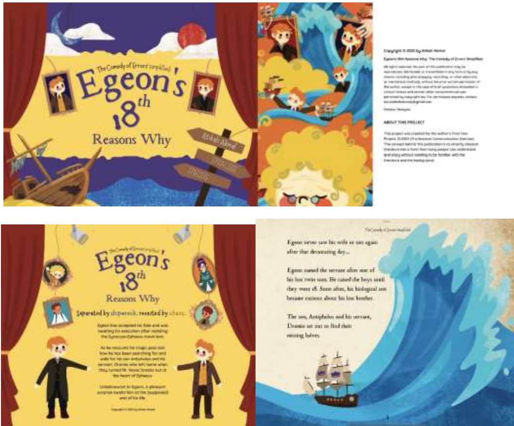
Figure 2: The Comedy of Errors Simplified: Egeon's 18th Reasons Why front cover, copyright cover, back cover, and some of its contents.

The survey questionnaire was made available through Google Form to individuals interested in interacting with it. Respondents were requested to share their knowledge of literature and other associated topics and their thoughts on them. To collect all the information from individuals who responded to the questionnaire, a total of eight questions were asked. As soon as the form was disseminated, the author got every response needed. The following questions made up the questionnaire.