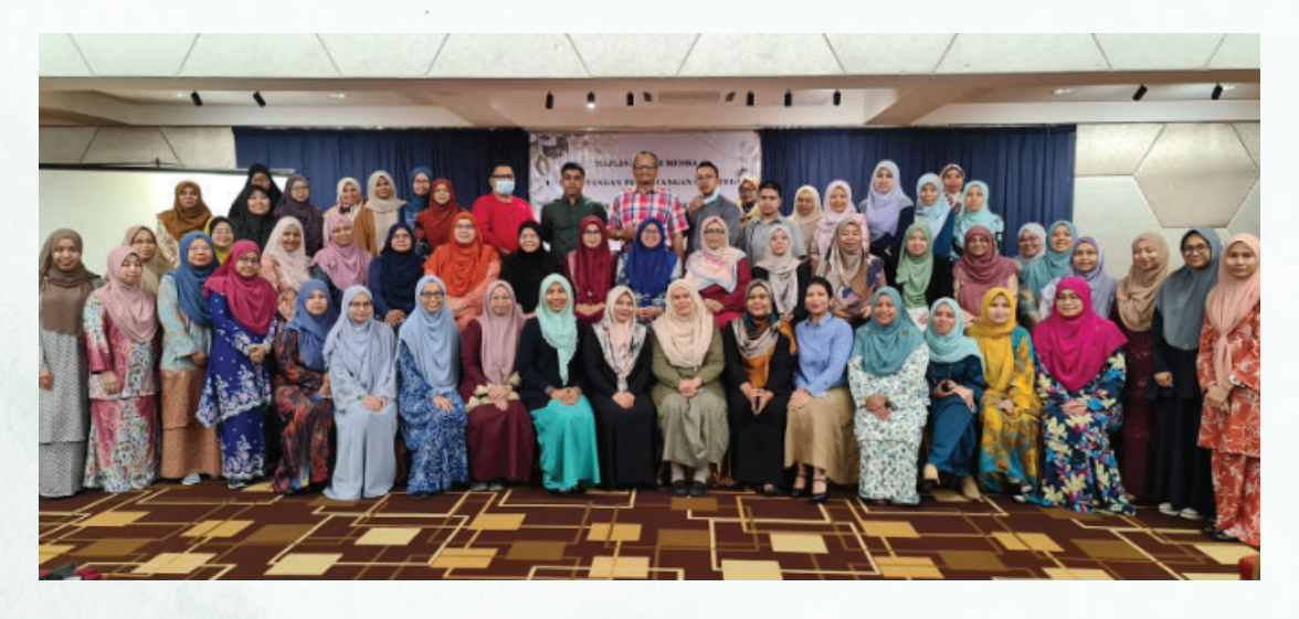
Figure 4: Participants of the PSPM Strategic Planning Workshop 2023

The second session was held on December 16, 2022, at Palm Hotel, Seremban, and involved the participation of all PSPM UiTM Negeri Sembilan Branch staff, with over 50 participants. This session primarily focused on presenting the findings from the first session by the group leaders.