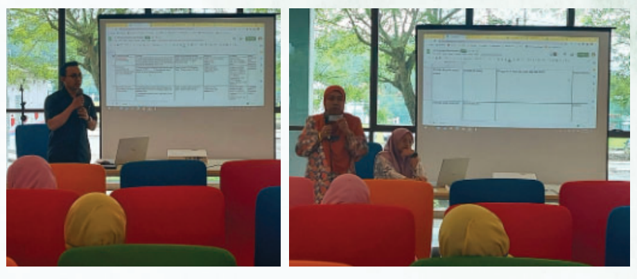
Figure 3: Session of presentations by group representatives

The second session was held on December 16, 2022, at Palm Hotel, Seremban, and involved the participation of all PSPM UiTM Negeri Sembilan Branch staff, with over 50 participants. This session primarily focused on presenting the findings from the first session by the group leaders.