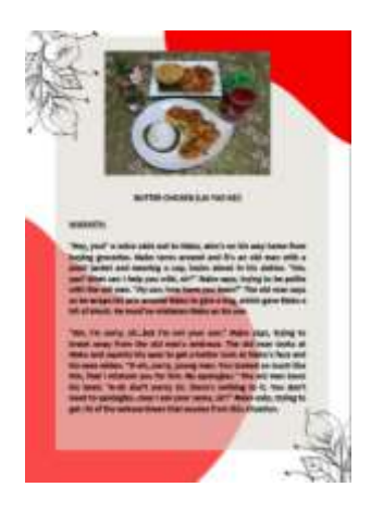
Figure 2. Short Story (snippet)

The next step is to start writing the recipes as poems and short stories. Overall there are two free verses ( Asam Pedas Pari and Ayam Palembang ), one haiku ( Sambal Ikan Bilis ) and two short stories ( Siakap Stim and Butter Chicken) in the book. A haiku is a type of poem originating from Japan. It is written in a style of three unrhymed lines consisting of 5, 7, and 5 syllables respectively (Sarkar, 2020). Haiku can be considered quite restrictive as the poet needs to adhere to the set syllable structure. In contrast, free verse is a type of poetry that resembles a speech and typically does not have a set pattern or rhythm. The combination of short stories and two different styles of poetry in the book not only provides variety but also exposes the readers to different types of creative writing.