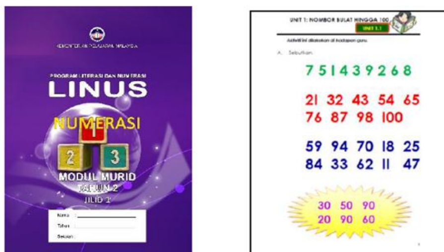
Figure 1: Kementerian Pendidikan Malaysia Linus Module

Courseware is a mixture of 'course' and 'software' phrases. This courseware includes several categories, including educational material, training, and instructional strategies. Courseware is an educational software used for digital education that utilize technology in learning. It comprises extra instructional content designed as teachers' kit or students' learning materials which is generally used with a laptop. The term dyscalculia is a mixture of the prefix 'dys' originated in Greek which means 'poorly' and the word 'calcula' that comes from 'calculare', a Latin word, which means 'to count'. Therefore, the meaning of dyscalculia is 'counting badly' (Kadosh et al , 2006). Dyscalculia students only learn for a few hours and the teacher teaches using their own creativity. The students also have some difficulties to learn such as slow in writing. In order to solve this problem, Kementerian Pendidikan Malaysia (KPM) has provided a Linus module for the dyscalculia students. Figure 1 shows the cover page of Linus module provided by the KPM.