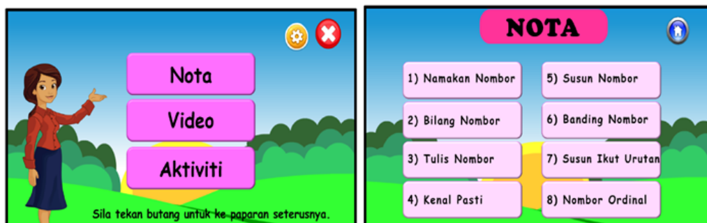
Figure 2 : Interfaces of MCDys

The teaching facilitators usually cover the curriculum, teaching results, distribution process and test processes (Abd Latih & Wan Ahmad, 2018). This phase contains two segments which are summative and formative. The overall efficiency of the directive is assessed and is generally assessed following the initial version of the instruction and generally after the initial version has been enacted. During and between stages, formative evaluations are continuous (Abd Latih & Wan Ahmad, 2018). Figure 2 and Figure 3 show the interfaces of the courseware and the example of the activities.