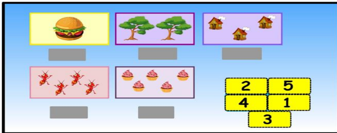
Figure 3: Drag and Drop Picture Activity