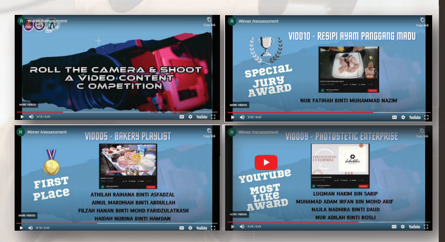
Figure 2: Winner announcement on website Roll the Camera & Shoot!.