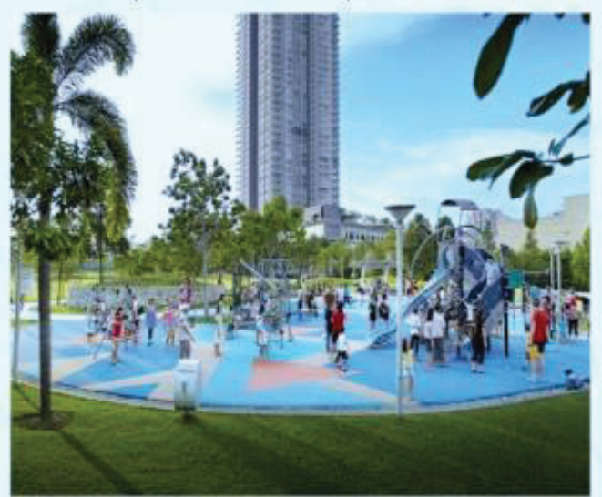
Landscaped park, children's playground with child-proof imported play equipments & iconic park benches

The jogging or walking paths also allow you to stretch your legs and get your heart pumping with some running exercises. The park approaching healthy lifestyle towards the community at Desa Park City.