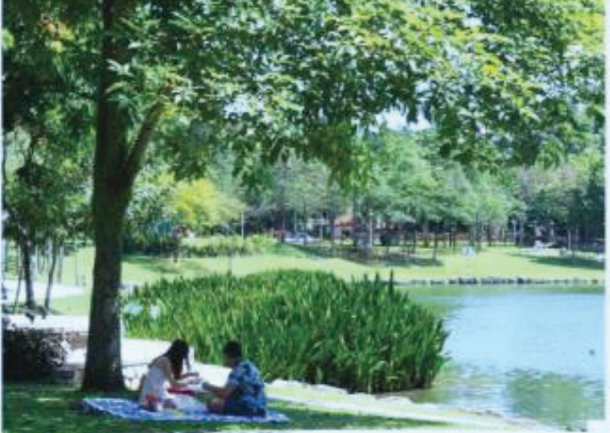
There are well-trimmed lawns where you could enjoy a picnic with your family to take you away from the busy rush of workdays.