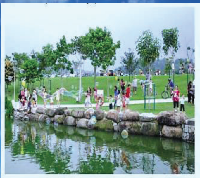
The central lake at the core of the central park, where you could take a chill and unwind from the day-to-day hassle of life to enjoy some moments of relaxation in a peaceful ambience.

The Central Park allows you to do both – slow down or speed up. Chill out on its manicured lawns and have a family picnic; a brief respite from the work week rush. Or get your heart racing by hitting its jogging paths with sprightly vigor. With the idyllic Central Lake at its core, The Central Park truly represents an ideal getaway from the tribulations of the city life.