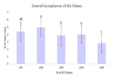
Figure 3.6: Overall acceptan