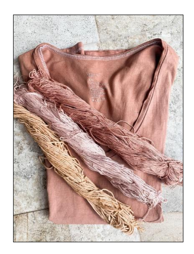
Figure 2: The result of successful dye shirt and yarn.