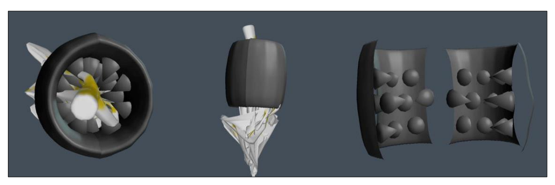
Figure 1: Prototype Design