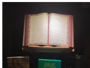
Figure 3. Malay Annals