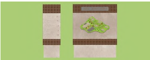
Figure 12. Directory Signage

focus on attractive visuals. The reason is when the text on the signage is minimal and have attractive visual, people will be able to read the sign easily as they pass by it and it also captured their eyes. If a sign contains too much text, then people will be more likely to tune it out.