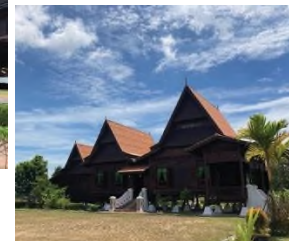
Figure 2. Warrior's house