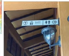
Figure 10. Small size of Wayfinding

Based on the problems encountered and the research that having been done, I have decided to design a new icon for the toilet facilities signage for Hang Tuah Centre. The icon has been conceptually designed as an illustration. Based on my references, the style of this new icon is more appropriate to modern style because it ease for visitors to see and find direction at Hang Tuah Centre. This concept has taken the reference of folk clothing in Hang Tuah's era to become a new icon. This can show the identity of the Hang Tuah Center itself because it is unique and cannot be found anywhere else. For the toilet signage, I have made the illustration of a man and woman wearing daily clothes during the era of the Malacca Malay Sultanate and also the Hang Tuah era.