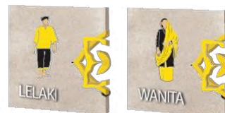
Figure 11. New Ideation of Wayfinding

Based on the problems encountered and the research that having been done, I have decided to design a new icon for the toilet facilities signage for Hang Tuah Centre. The icon has been conceptually designed as an illustration. Based on my references, the style of this new icon is more appropriate to modern style because it ease for visitors to see and find direction at Hang Tuah Centre. This concept has taken the reference of folk clothing in Hang Tuah's era to become a new icon. This can show the identity of the Hang Tuah Center itself because it is unique and cannot be found anywhere else. For the toilet signage, I have made the illustration of a man and woman wearing daily clothes during the era of the Malacca Malay Sultanate and also the Hang Tuah era.