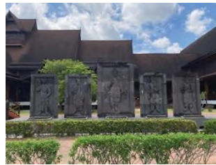
Figure 1. Stone Sculpture

Hang Jebat. Visitors can learn the art of self-defense there. Furthermore, Gallery Dang Merdu presents cultural and historical artefacts related to Hang Tuah.