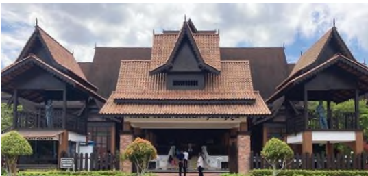
Figure 5. Hang Tuah Centre Main Building

A logo is a unique, identifying picture or symbol that's uniformly used to identify the company. As a portion of brand's identity, the logo should help promote Hang Tuah Centre and increase their brand identity. With that, based on the existing logo, it needs to be designed with a new design because the logo is outdated and does not attract people to know more about Hang Tuah Centre. Based on the research that I have done, I have chosen Hang Tuah Centre's main building as the main subject to create an interesting logo design.