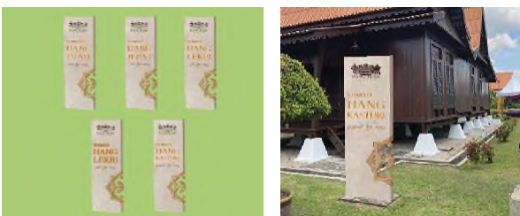
Figure 13. Warrior's Houses Signage Figure 14. Warrior's Houses Signage

For the types of material that I have been using for directional signage at Hang Tuah Centre is elemental concrete. The reasons why I use elemental concrete material is because this material is one of the materials that are suitable with the surroundings around Hang Tuah Centre.