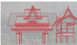
Figure 6. The implementation of Hang Tuah Centre Main Building

After making the sketches, I discussed them with the lecturer and made improvements before I made the design digitally. After that, I consult with the lecturer about the digital design, and then started the process of finding the right color to represent Hang Tuah Centre's identity. After I finished with the color selection, I continued the process by finding a typography that was easier to read and easier for others to remember.