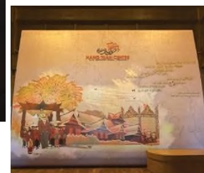
Figure 4. Warrior's house