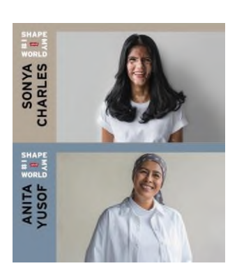
Figure 2: Levi's 'I Shape My World' campaign celebrates extraordinary Malaysian women for Internation Women's Day, 2019.

In celebration of International Women's Day (March 8), Levi's launched a campaign paying tribute to strong female figures. It invites women to share their compelling stories to the world.