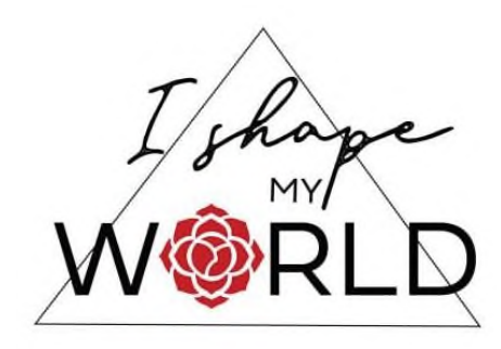
Figure 8: New logo have inverted triangle composition

Because women have the strength, self-assurance, and capacity to form their own worlds without regard to what other people think of them or how undervalued they are, I created the logo with a triangular shape behind it.