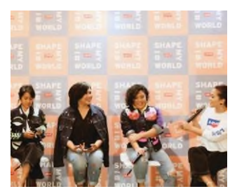
Figure 1: I Shape My World For International Women's Day, Indonesia. 2019

Lack of confidence and low esteem has been a problem to women around the world. From the very beginning of Levi's, they celebrate women all abilities, shape and style. This campaign is to appreciate ladies that already achieve certain goals and achievement in their life. Levi's campaign also does not differentiate between gender, race, and age. Levi's can fit for everyone, not just for women but men too.