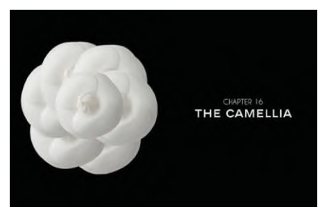
Figure 6: Camellia flower inspired by Chanel

For my final year project, I redesign the overall concept of the campaign. The process took me 2 weeks to bring the idea and concept. I made some research and brainstorming about women elements and finally I came out with camellia flowers inspired from Chanel brand product who brought a meaningful meaning forwomen which is - "white camellias symbolize purity and innocence. It also symbolizes admiration, love and respect."