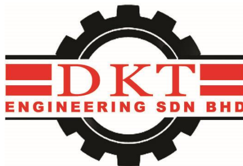
Figure 3: Company Logo

I am currently undergo an industrial training at DKT Engineering Sdn. Bhd. I have been assigned to work at their headquarters or the main office located in Kuala Kangsar, Perak. Below shows the company logo that have been use since the beginning of the organization.