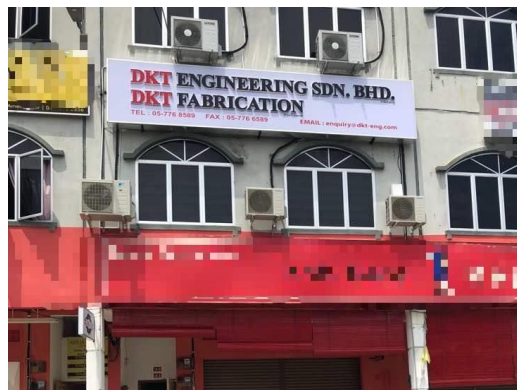
Figure 2: Company headquarters

I am currently undergo an industrial training at DKT Engineering Sdn. Bhd. I have been assigned to work at their headquarters or the main office located in Kuala Kangsar, Perak. Below shows the company logo that have been use since the beginning of the organization.