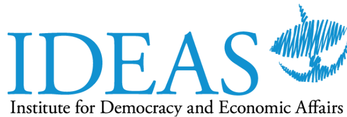
Figure 2: Company's Logo