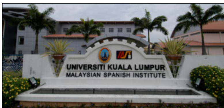
Figure 2: Entrance of UniKL-MSI

UniKL-MSI began operations in August 2002 at the temporary campus at Techno Center, Kulim Hi-Tech Park, and later relocated to the main campus in December 2003, which was constructed on a piece of land measuring approximately 39 acres, also in Kulim Hi-Tech Park, Kulim, Kedah. It was established in August 2002 as a collaboration project between the Malaysian government and the Spanish government, represented by MARA.