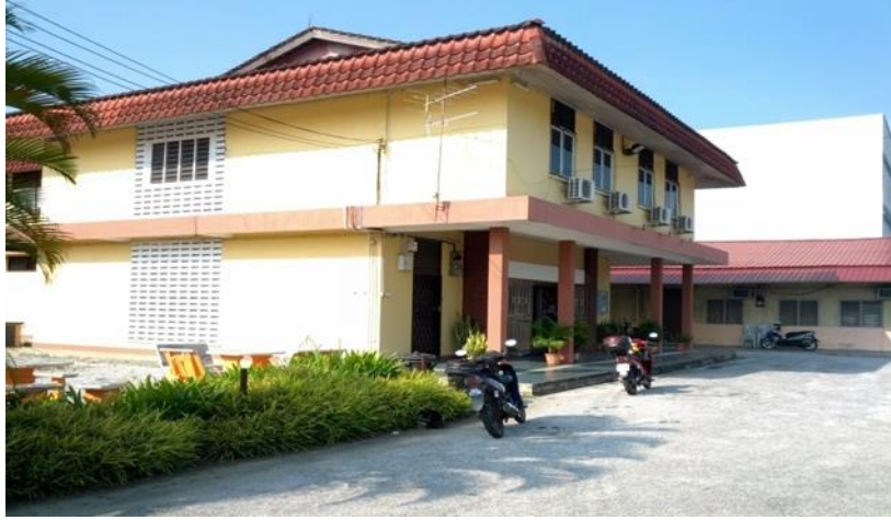
The main office of PPK Hutan Melintang