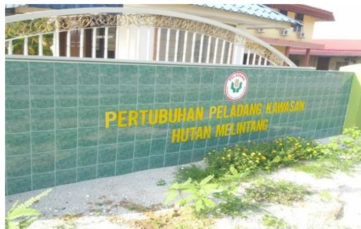
Signboard and front gate of PPK Hutan Melintang.

Location: Bt 12, Jln Bagan Datoh, Simpang 4, 36400, Hutan Melintang, Perak.