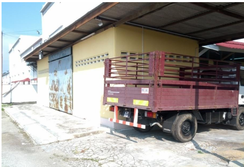
Store of fertilizers and their lorry