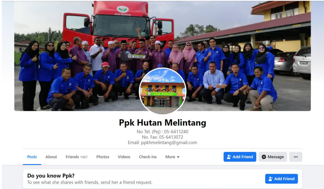
Social media (Facebook) of PPK Hutan Melintang.