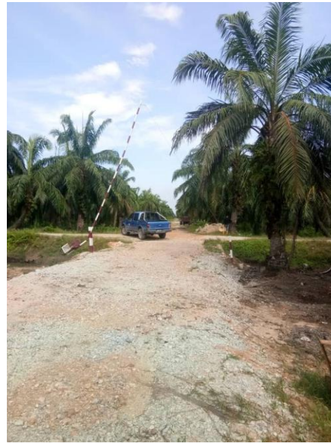
Their main business which is palm oil cultivation.

Pertubuhan Peladang Kawasan Hutan Melintang was established initially at Bt 14, Jln Bagan Datoh, Simpang Empat, 36400 Hutan Melintang, Perak in 1975. Before this, PPK Hutan Melintang was known as Persatuan Peladang Kawasan Hutan Melintang that was operated in 1970 until 1975 under the agriculture department. In 1975, Persatuan Peladang has been dissolved and become Pertubuhan Peladang when LPP acquires full management and department also appoint its own workers. PPK Hutan Melintang received their own land and buildings in 1985, at Bt 12, Jln Bagan Datoh, Simpang Empat, 36400 Hutan Melintang, Perak. PPK Hutan Melintang are responsible to conduct 132 800 acres for Mukim Hutan Melintang, 22 400 acres for Mukim Teluk Bharu, and 20 800 acres for Mukim Sungai Durian. They conducted 41 units that consist of 5,233 of members with paid capital of more than RM 3 million.