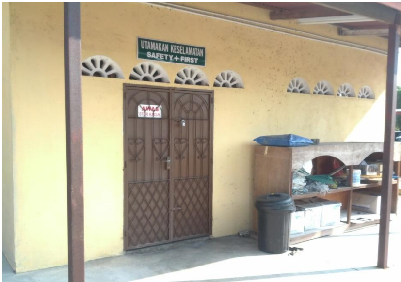
Store of pesticide and herbicide.