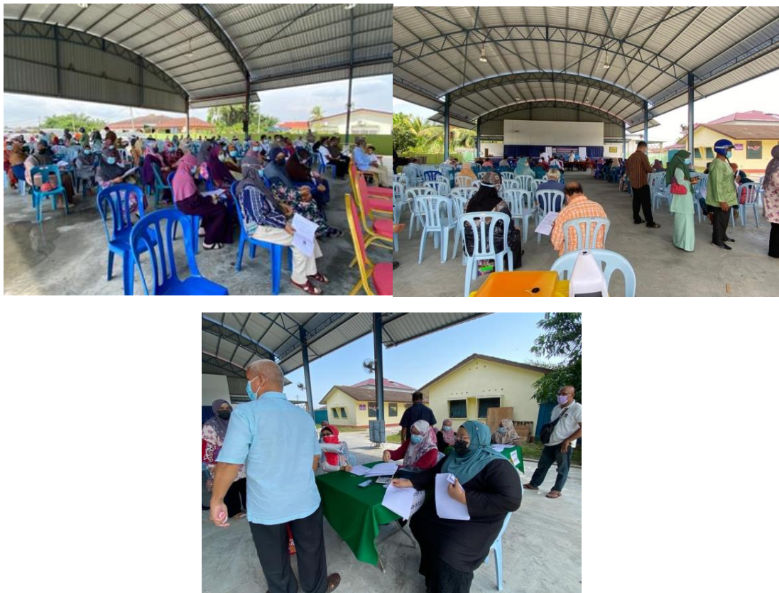
Annual General Meeting with PPK Hutan Melintang members/investors.