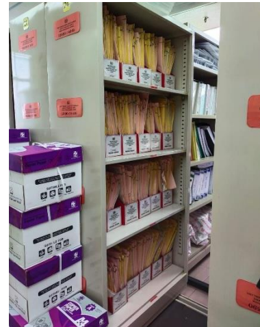
Figure 2: All proportional holdings in the file room.