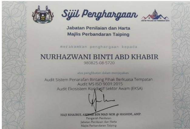
Figure 1: ISO and EKSA audit certificates