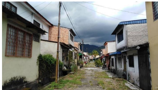
Figure 3: Visit Sites