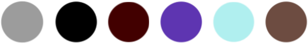
Figure 2.1 shows the colours available for Wrinkle Busters machine.