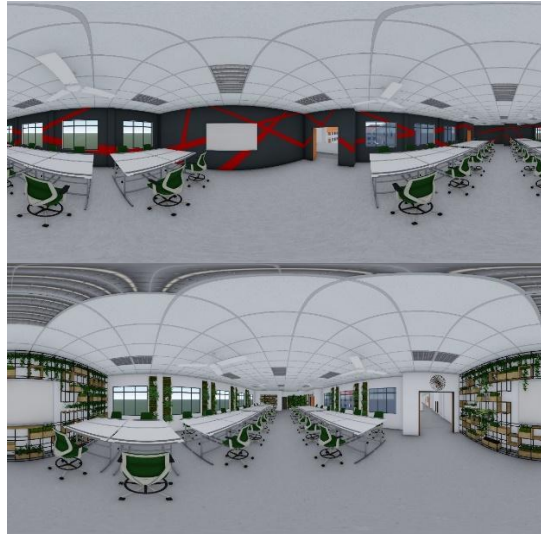
Figure 1: Spherical photo of non-plants interior studio (left) and interior studio with plants (right)

Participants are selected among architectural students of Polytechnic Sultan Idris Shah (PSIS), Sabak Bernam, Selangor. 30 volunteers participated in the research (21 male, 9 female) and they were already in the fourth semester when the experiment was conducted. Participants wore the Oculus Go VR headset to view both virtual environments of their studio, which are non-plants indoor and studio with indoor plants, as shown in Figure 1. Participants spent around 2 minutes for each virtual studio while Emotiv Epoc+ recorded the brain activity and automatically analysed using performance metrics which displayed application on a scaled axis from 0 to 100. Performance metrics consist of 6 metrics which are stress, engagement, interest, excitement, focus and relaxation. After completing the experiment session, participants were asked to answer a self-report questionnaire using the format of a semantic differential scale as shown in the flow, in Figure 2.