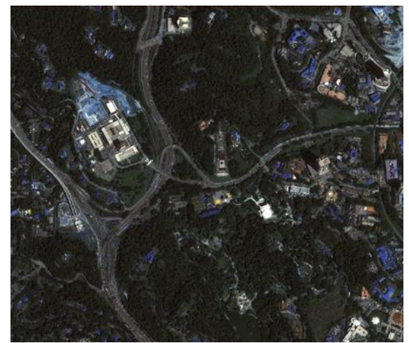
Figure 1: Pleiades imagery of National Monument Park, Kuala Lumpur

The selected study area is located in the National Monument Park, Kuala Lumpur, Malaysia. The study area covers the coordinates of 3° 8' 51" N, 101° 41' 36" E. The National Monument Park is located to the north of Taman Botani Perdana, with Padang Merbok in the south-east and Bank Negara's Lanai Kijang to the east of the site. The site is contiguous with Taman Botani Perdana and is separated only by Jalan Parlimen It can be seen as an expanse of green spaces.