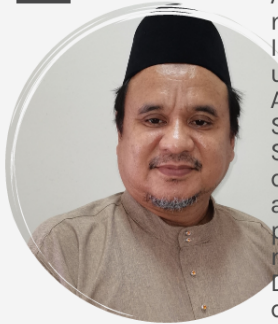
ALUAN KETUA EDITOR

Al-Hamdulillah bersyukur kita ke hadrat Allah swt, dengan penerbitan edisi ketiga makalah Mathematics in Applied Research terbitan Kolej Pengajian Pengkomputeran, Informatik, dan Media UiTM kampus Seremban. Penerbitan ini merupakan satu usaha untuk menonjolkan hasil penyelidikan pelajar bersama pensyarah dalam Projek Tahun Akhir program ijazah sarjana muda di KPPIM Seremban.