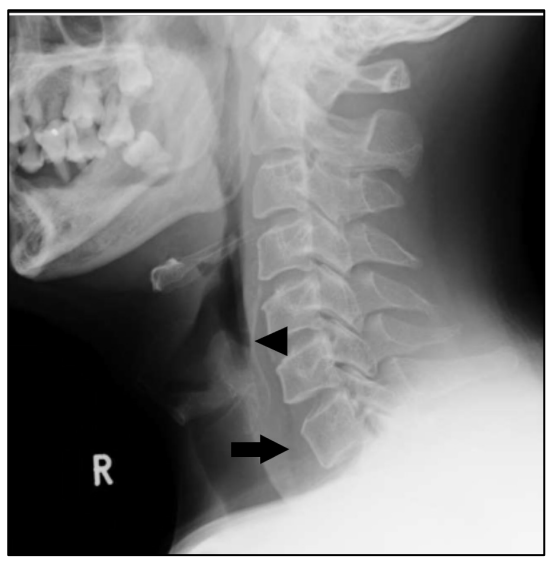
Figure 1 Lateral soft tissue neck X-ray shows long segment of air trapping in the oesophagus (arrow), suggestive of foreign body impaction at the level of C6 and C7 region. Calcified posterior border of thyroid cartilage (arrowhead) may be mistakenly interpreted as foreign body at the level of C5 and C6

meat with a broken long satay skewer stuck in a horizontal position, and its sharp end pointed to the oesophageal wall at 3 o'clock (Figure 2). The chicken meat was first removed in pieces, followed by dislodging the 3.5-cm long satay skewer into a vertical position (Figure 3). A repeat rigid oesophagoscopy was performed 25 cm from the upper incisors, which revealed mild abrasion with oedematous mucosa at 3 o'clock, and 17 cm from the upper incisor, but no perforation was observed. Due to multiple loosening of teeth, his upper three incisors were accidentally extruded during the procedure and an immediate dental consultation was scheduled (Figure 4). After the procedure, a nasogastric tube was inserted and no oral intake was permitted. Intravenous antibiotic amoxicillin-clavulanate was initiated. A CXR was performed and revealed no signs of oesophageal perforation or mediastinitis. On day 1 post-operation, he was allowed to consume clear water and subsequently a soft diet after no apparent signs and symptoms of oesophageal perforation, such as fever, chest pain, interscapular pain and tachycardia, were observed. His main symptoms such as odynophagia, chest discomfort and shortness of breath were completely resolved, and he was discharged on day 2 post-operation. A 1-week follow-up was scheduled at our outpatient clinic, and a 5-day oral antibiotic was initiated for the patient.