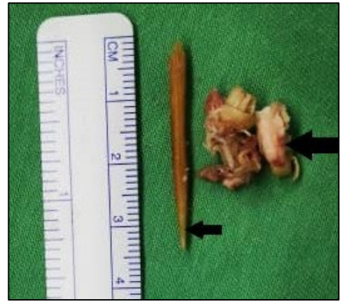
Figure 3 Successfully removed broken, wooden satay skewer with sharp end measuring 3.5cm in length (small arrow) and chicken meat (big arrow)