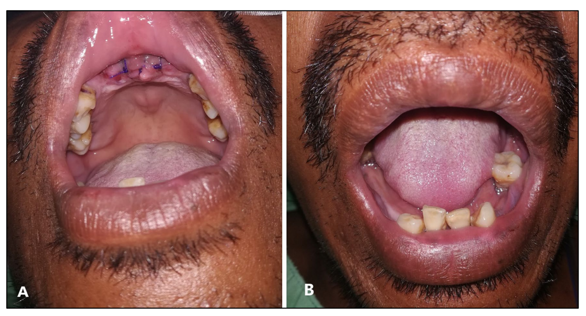
Figure 4 Poor dental hygiene with accidental extrusion of upper 3 incisors (A) and multiple loosening of lower 4 incisors (B)