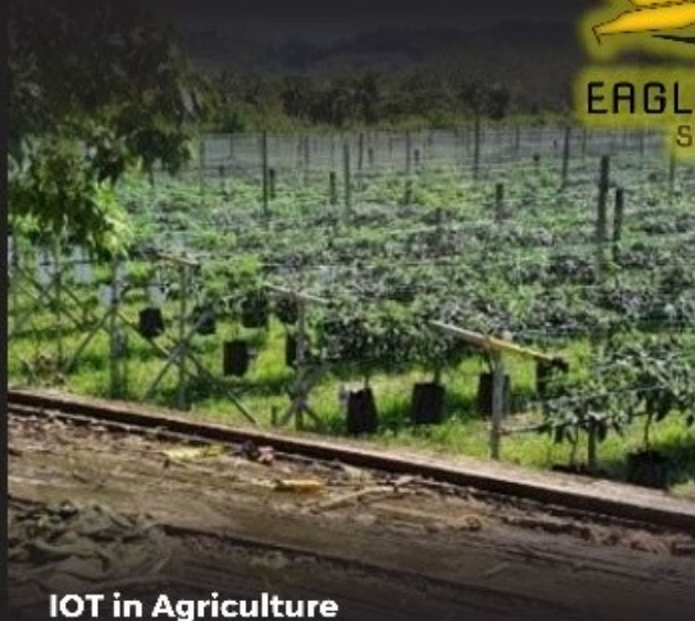
IOT in Agriculture