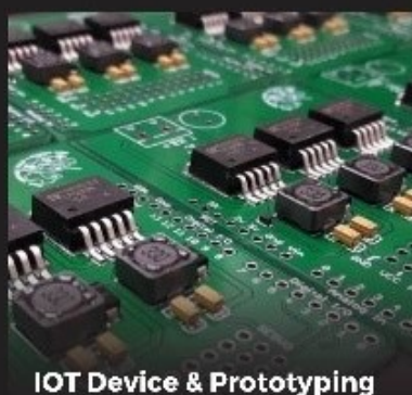
IOT Device & Prototyping