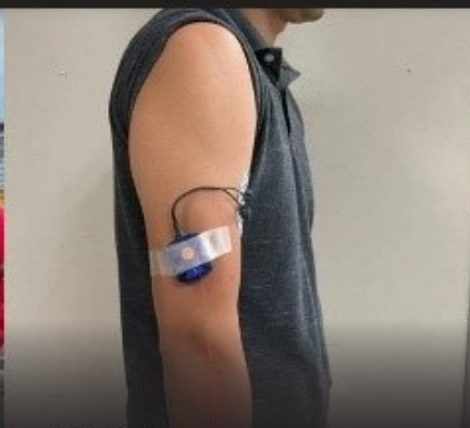
IOT in Sports