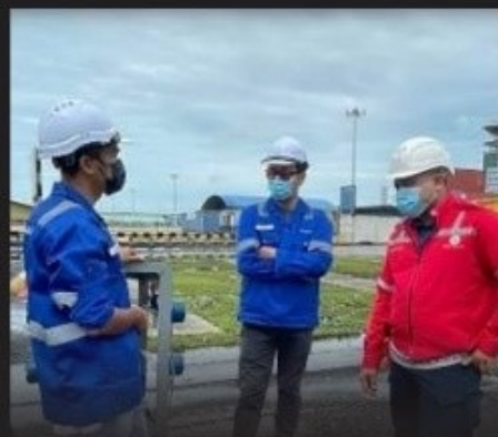
IOT in Safety & Health