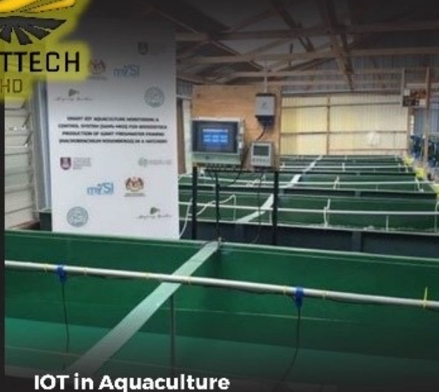
IOT in Aquaculture