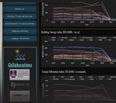
IOT in Energy Monitoring