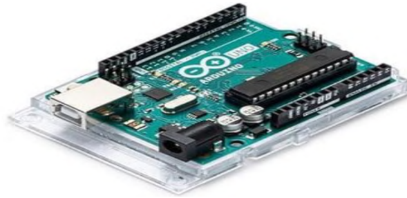
Figure 1.2: Arduino Board [3]

The Arduino can read inputs such as light on a sensor, a finger on a button, or a Twitter message and the turn it into an output. It also can activate a motor, turning on an LED (Light Emitting Diode) or publishing something online. It is commonly used for computing projects, interactive installations, and rapid prototyping. The Arduino has many types which is ARDUINO UNO, ARDUINO LEONARDO, ARDUINO 101, LILYPAD ARDUINO USB, ARDUINO ROBOT, ARDUINO ESPLORA, ARDUINO MICRO, ARDUINO MEGA 2560, ARDUINO NANO, ARDUINO MINI, ARDUINO YUN AND ARDUINO ZERO [2].