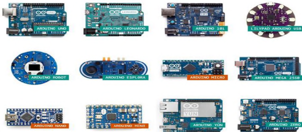
Figure 1.3: ARDUINO TYPES [2]

The Arduino can read inputs such as light on a sensor, a finger on a button, or a Twitter message and the turn it into an output. It also can activate a motor, turning on an LED (Light Emitting Diode) or publishing something online. It is commonly used for computing projects, interactive installations, and rapid prototyping. The Arduino has many types which is ARDUINO UNO, ARDUINO LEONARDO, ARDUINO 101, LILYPAD ARDUINO USB, ARDUINO ROBOT, ARDUINO ESPLORA, ARDUINO MICRO, ARDUINO MEGA 2560, ARDUINO NANO, ARDUINO MINI, ARDUINO YUN AND ARDUINO ZERO [2].