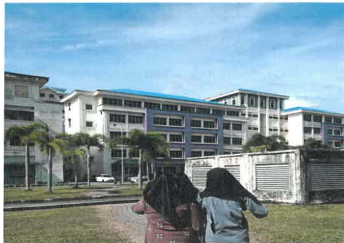
Figure 2.1 shows we go for tour around the campus on first day internship.

Learn the difference of Bill of Quantation (BQ) and Validate Order (VO) and how to analyse which company is suitable for the proposed project.