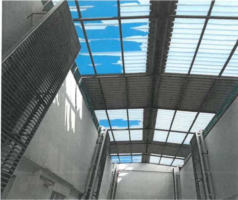
Figure 2.8 shows damage occurs at college building.