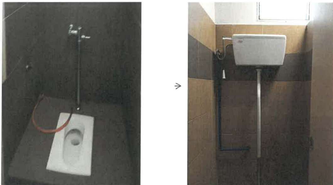
Figure 3.3 shows modified works for toilet flush system.

of the box. This is because when I went to site visit for modified works I learn that some problem was not taught directly but we need to find a way on how to solve the problem. For example the modification works at toilet Kolej Intan. They modified the pipe to flush from only applicable for WC Flush Valve to High Level Single Flush Cistern. The contractors were facing maintenance problem as there was a valuable in the WC Flush Valve that was stolen more than 20 units in that building. To repair the WC Flush they need to buy the missing components but it as costly in price. To tackle this problem, they suggest to modified the pipe so they can install High Level Single Flush Cistern. The reasons they want to change to the cistern is the components for the cistern is easily installed, cheap in price, high water pressure, and low cost of maintenance.