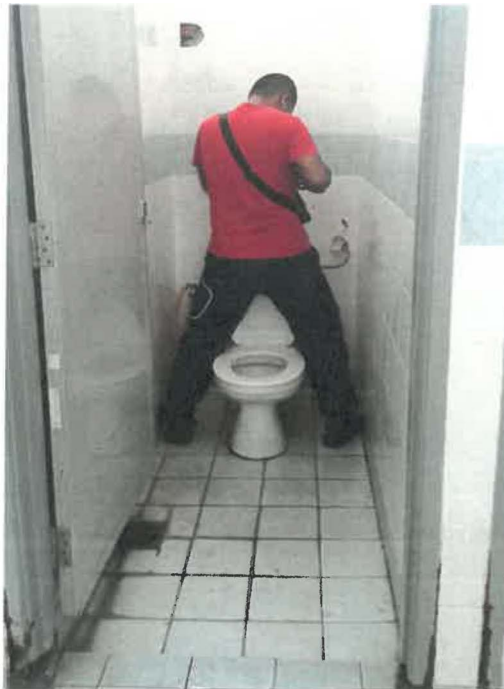
Figure 2.3 shows we assist our supervisor repairing flush valve.