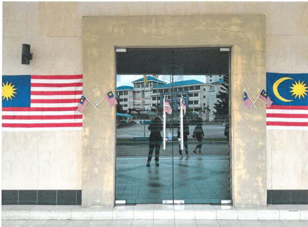
Figure 1.1 shows PPF UiTM Permatang Pauh main entrance.

‘Pejabat Pengurusan Fasiliti’ was known as the ‘Pejabat Jurutera Tempatan’ was established in 1972. In 1982, ‘Pejabat Jurutera Tempatan’ changed their name to the ‘Bahagian Pembangunan dan Penyelenggaraan’. In 1994, ‘Bahagian Pembangunan dan Penyelenggaraan’ was recognized as ‘Pejabat Pembangunan dan