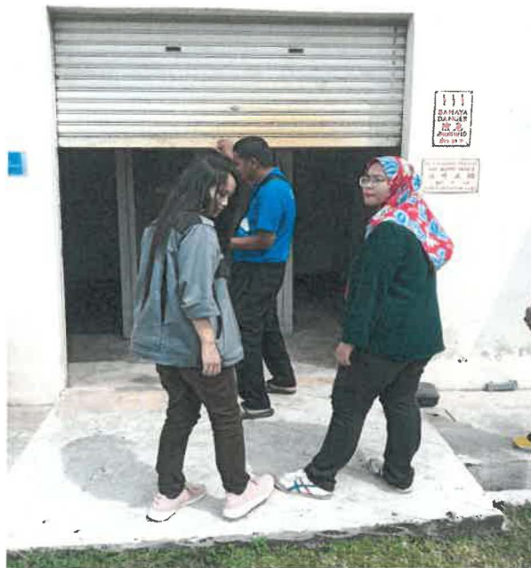
Figure 2.6 shows Transformer's Room that need installation of small drainage.