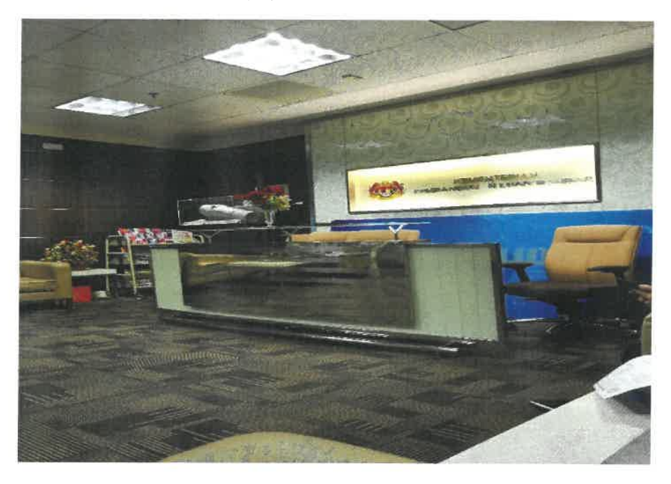
Figure 6: KPLB Putrajaya