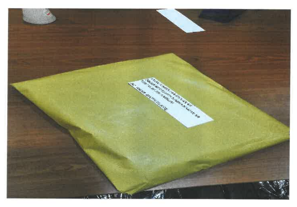
Figure 4:Tender document