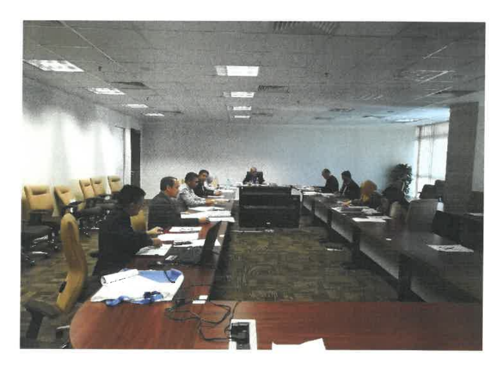
Figure 5:Meeting for government project