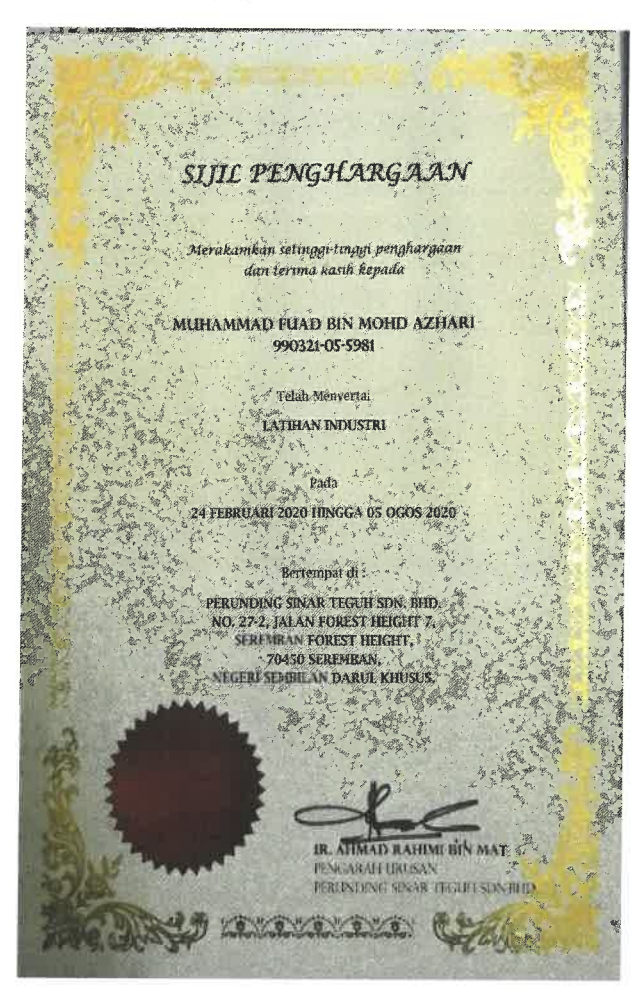
Figure 8:Certificate of Completion of Industrial Training