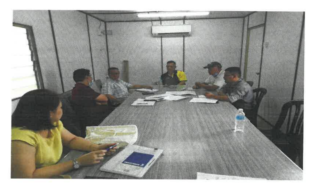
Figure 7:Meeting for private project