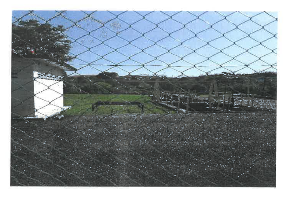
Figure 1:One of the STP in UKM