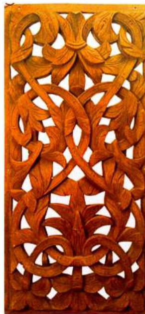
Figure 1. Motif Flora

On everything from household items to boats and utensils, floral motifs predominated in Malay woodcarving. The artisans chose to implement their ideas after being inspired by the profusion of plant species in the home complex and nearby forest. For this element, most people turn to vine-like plants like ketubit , guri , bunga cina , and others like star anise and hibiscus. Plants have inspired Malays carvers for centuries (Faisal, et al., 2018). They are constantly soaking in the beauty of their surroundings and transforming it into something others may appreciate (Figure 1).