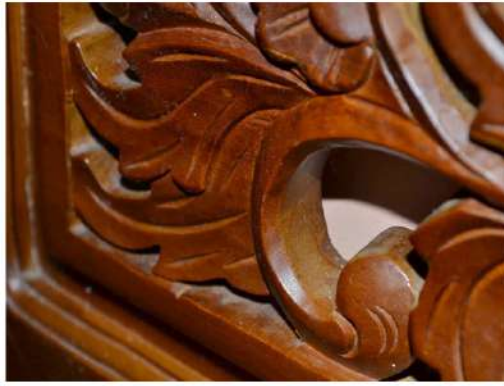
Figure 8. Tebuk Silat Wood Carving - using Awan Larat motif

In the observation of the Awan Larat motif, the researchers have chosen a specific part on the Awan Larat motif based on its behavioural and structural form. After picking the significant part of the motif from the wood carving pattern, the researcher has simplified the motif using a pencil sketch (Figure 9A) in order to generate a prototype for the subsequent digitization process. After the sketching phase, the researcher digitalized and implemented the Awan Larat motif into a modern typeface. In this example, the researcher has chosen the typeface "Arial Bold" (Figure 9B). For this digitization process, the researcher utilised Adobe Illustrator as the appropriate software to demonstrate that the Awan Larat motif may be incorporated into the typeface to symbolise the Malay identity.