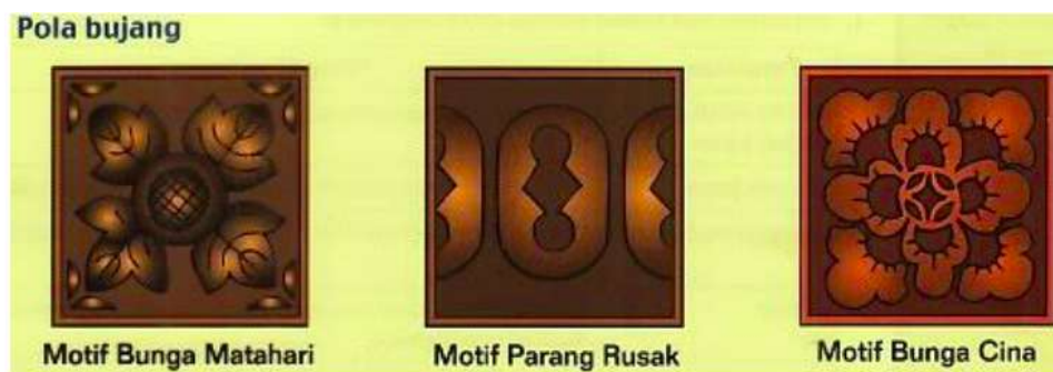
Figure 5: Pola Bujang

In the fourteenth century, the aesthetic craft development of Malay culture became more influenced by the concept of Tawhid, which is the realisation of God's oneness (Esa, 2019). Awan Larat , was taken for use as a symbol to represent the significance of the relationship between humans, the cosmos, and Allah (God). This form of independence is in no way attached, connected, or expressed. Pola Putu or also known as Pola Bujang is an alternative term for it. Flowers, fruit, and flower buds are recurring themes in this motif with a single design and no repetitions (Aida Kesuma Azmin et al., 2021) (Figure 5). Due to its delicate nature, Awan Larat is composed of joined sections that produce a single complete carving. These pieces are suitable for a range of compositions and tend to place a larger emphasis on plant features. In other words, Awan Larat is a visual form based on the repetition of a motif in a particular arrangement and composition, with no interruptions in the linkages between the motif's repetitions. This notion entails the interaction of pieces, such as leaves, tendrils, flower buds, flowers, and shoots, within a full composition.