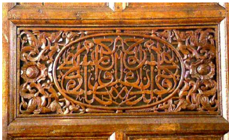
Figure 3. Motif Calligraphy

After the arrival of Islam to the Malay Archipelago, local artisans carved Jawi calligraphy and Qur'anic verses. Malay artisans who employ a variety of Arabic scripts convert Quranic verses onto wooden panels. As seen by this etching, Islam and the Quran as a compilation of God's words were treasured. With this design, relief carving, perforated carving, or a mix of the two are all feasible (Kari, et al., 2018). Calligraphy is frequently used to convey a message to the public on Islamic structures, such as mosques and private residences (Figure 3).