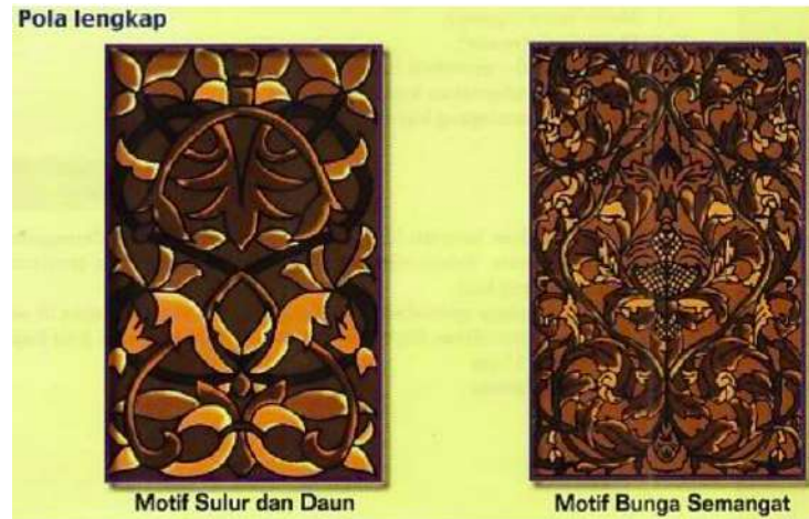
Figure 6. Pola Lengkap