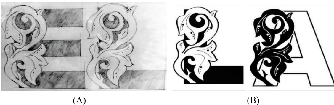
Figure 9. (A) After stylize the motif implementation on sketches; (B) After sketches, implementation on digital

In the observation of the Awan Larat motif, the researchers have chosen a specific part on the Awan Larat motif based on its behavioural and structural form. After picking the significant part of the motif from the wood carving pattern, the researcher has simplified the motif using a pencil sketch (Figure 9A) in order to generate a prototype for the subsequent digitization process. After the sketching phase, the researcher digitalized and implemented the Awan Larat motif into a modern typeface. In this example, the researcher has chosen the typeface "Arial Bold" (Figure 9B). For this digitization process, the researcher utilised Adobe Illustrator as the appropriate software to demonstrate that the Awan Larat motif may be incorporated into the typeface to symbolise the Malay identity.