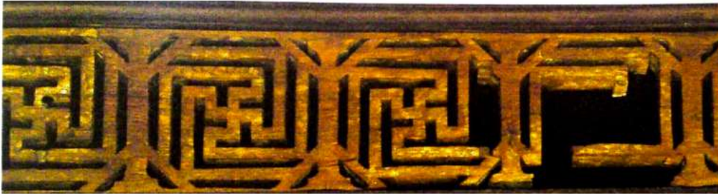
Figure 4. Motif Geometric