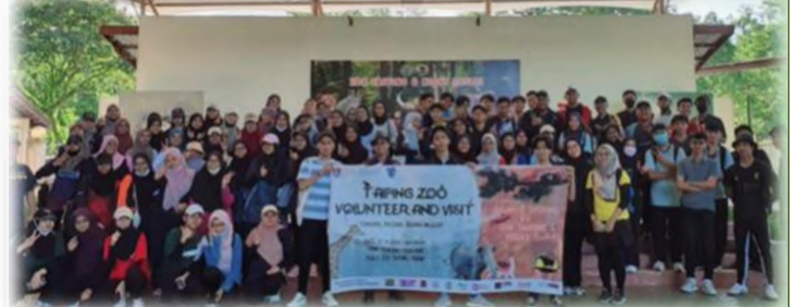
Group photos of volunteers from UiTM CPP