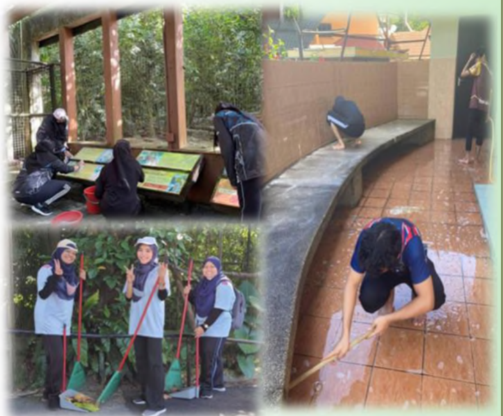
Volunteers at work