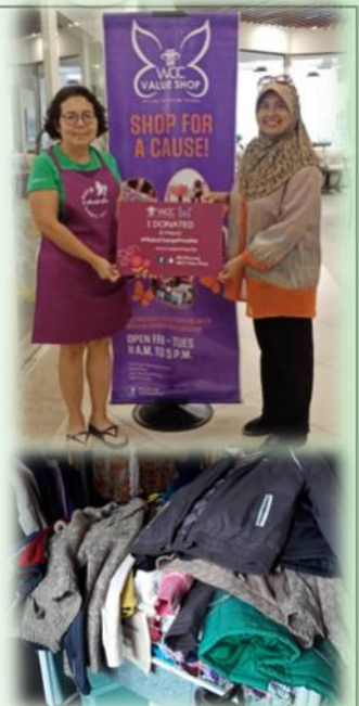
The author donating clothes to WCC Value Shop

However, when donating to thrift or value shops, it is best to donate items that have selling points. Thrift store items