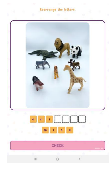
Figure 1. iAgree Interface