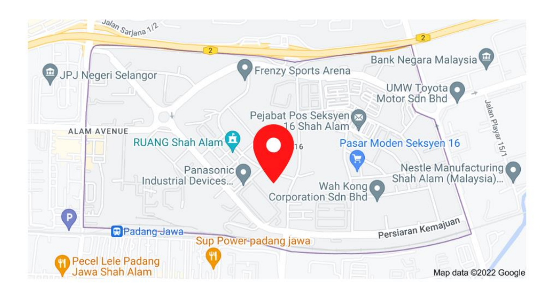
Figure 1 show our location at Alam Avenue, Seksyen 16, Shah Alam , Selangor

We only have one of our stores open. The daily use of our facility merely necessitates infrequent upkeep and changes. Our industrial process succeeds because of clean, well-maintained facilities. Alam avenue, Seksyen 16 in Shah Alam, Selangor, is a fantastic location for our scarf business that is close to the city. In order to draw potential customers from other countries, we chose a strategic location. in the same vein as. We were able to develop a marketing strategy as a result for our lids. We also purchase from fabric wholesalers in Selangor to obtain fabric supplies. We can now obtain high-quality supplies even locally, thanks to this.