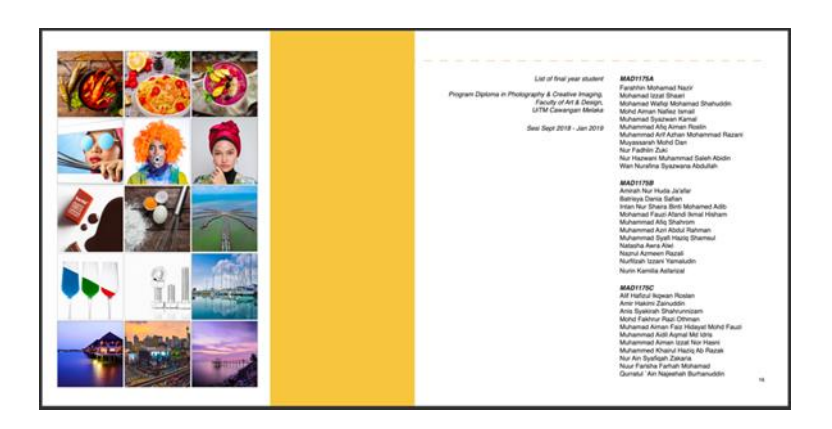
Figure 4. List of final year students