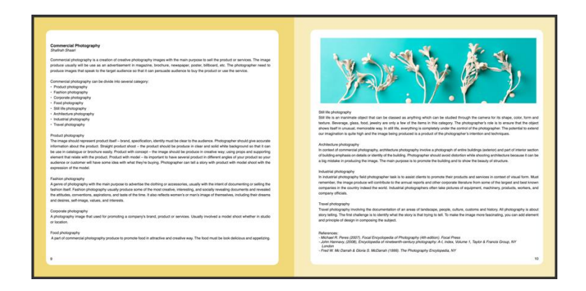
Figure 3. Articles