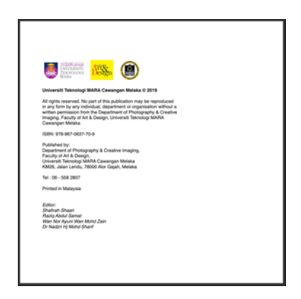
Figure 2. Copyright page and ISBN Number