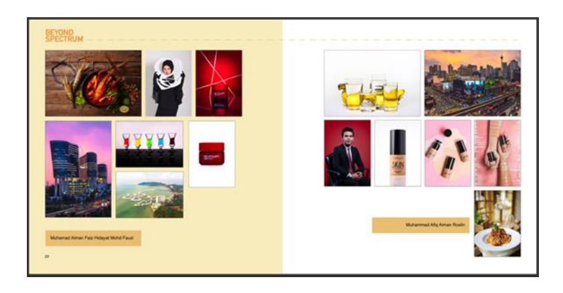
Figure 5. Artwork student