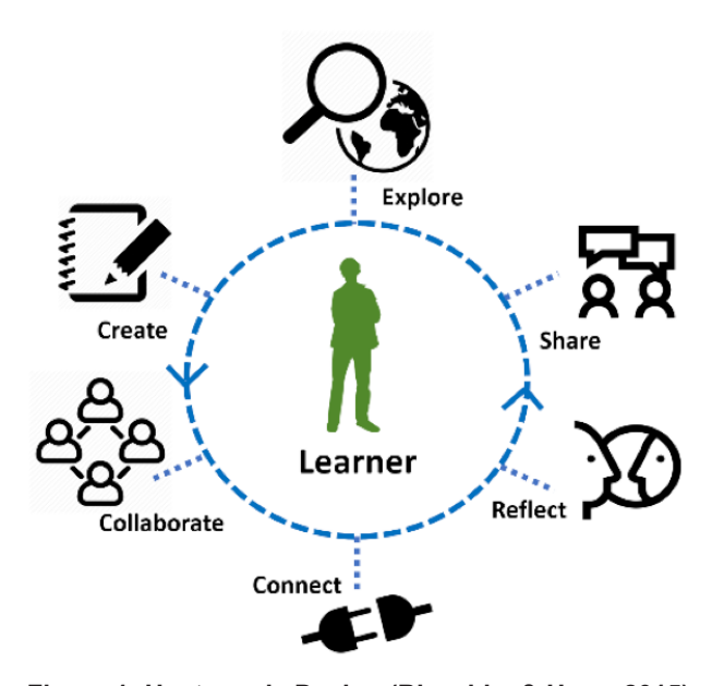
Figure 1: Heutagogic Design (Blaschke & Hase, 2015)

Blaschke and Hase (2015) have illustrated how the learner and educator or learning leader may design heutagogic experiences as shown in Figure 1, that explains a learner should explore, create, collaborate, connect, reflect and share with their friends, peers, educators, which may also involve the society. A learner will explore independently and select the most appropriate topic to be investigated. The process begins with the learning contract (Blaschke & Hase, 2015), where educators and learners identify the learning needs and what are the expected outcomes.