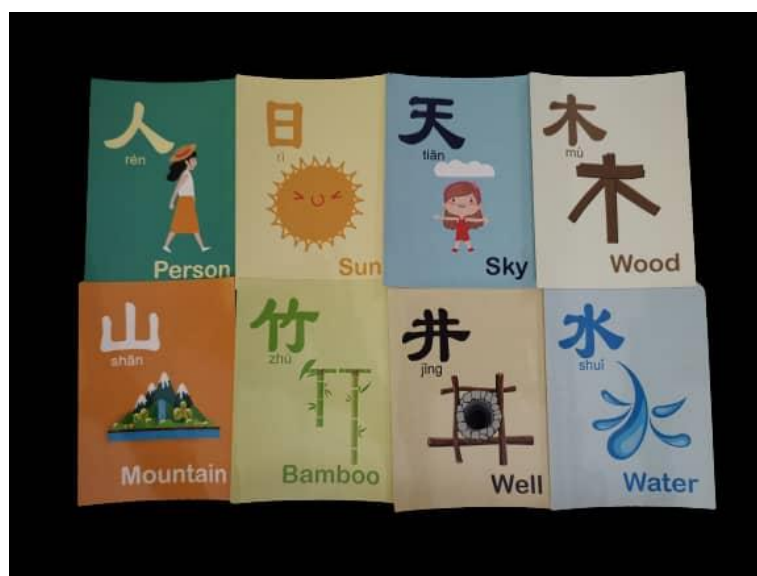
Figure 2 Cue cards with pictures that resemble Chinese characters

The LiSCReW is a fun and easy-to-learn educational board game designed by researchers to help non-native learners learn Chinese characters. Happiness, according to Csikszentmihalyi (1990), is the goal that people persuade themselves to achieve. As a result, LiSCReW features a colorful, appealing, and parents' childhood board game design to ensure that non-native learners are happy and enjoy themselves while playing and learning. Furthermore, for 32 Chinese characters, a picture that resembles a Chinese character has been creatively drawn to help students feel comfortable recognizing and memorizing them. The cue cards used in the LiSCReW family board game are depicted in Figure 2.