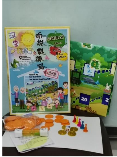
Figure 3 Components inside the LiSCReW box