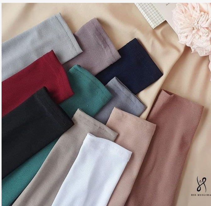
Tasneem Handsock RM 13