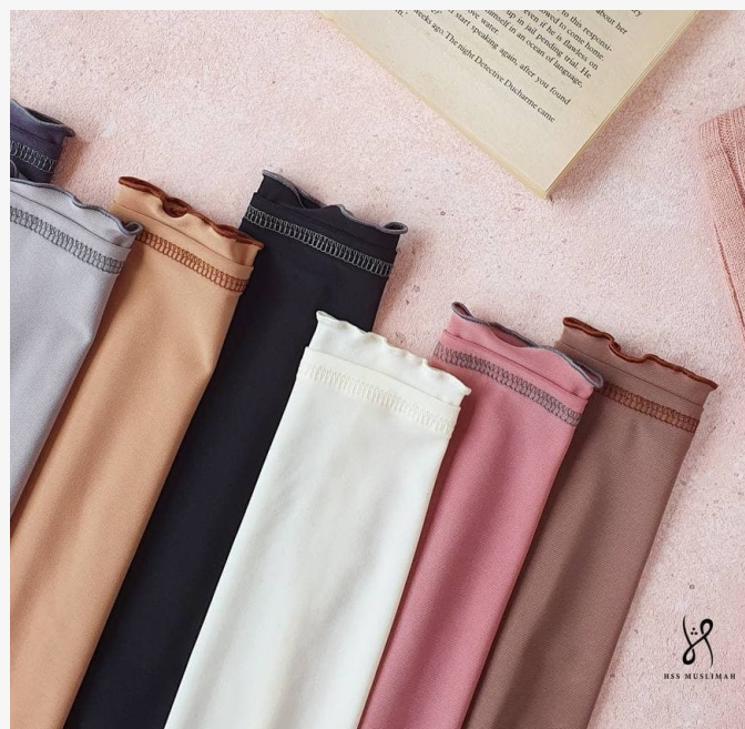
Hanalily Handsock RM 18