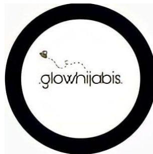
Figure 5 Glow.Hijabis Logo

The name of the online business created is Glow.Hijabis. The name is inspired by the word “glow”, which means to shine with a steady light and “hijabis”, which means Muslim women that wears hijab. It is a positive respond that we can created a good vibe while pronouncing Glow.Hijabis.