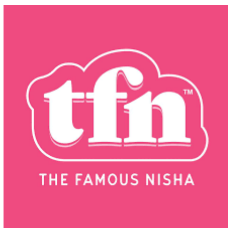
Figure 1.0 Tfn Brownie logo

The business is located at No.20, Jalan Selasih 11, Taman Selasih Fasa 1, 68100 Batu Caves, Selangor. This business required me to work from home since the stock is from my home. I focused in Selangor area to deliver the products but I also can use postage delivery to anyone live in different state. The business expanding bigger around the state. I'm choosing my house as a starting point to start my business.