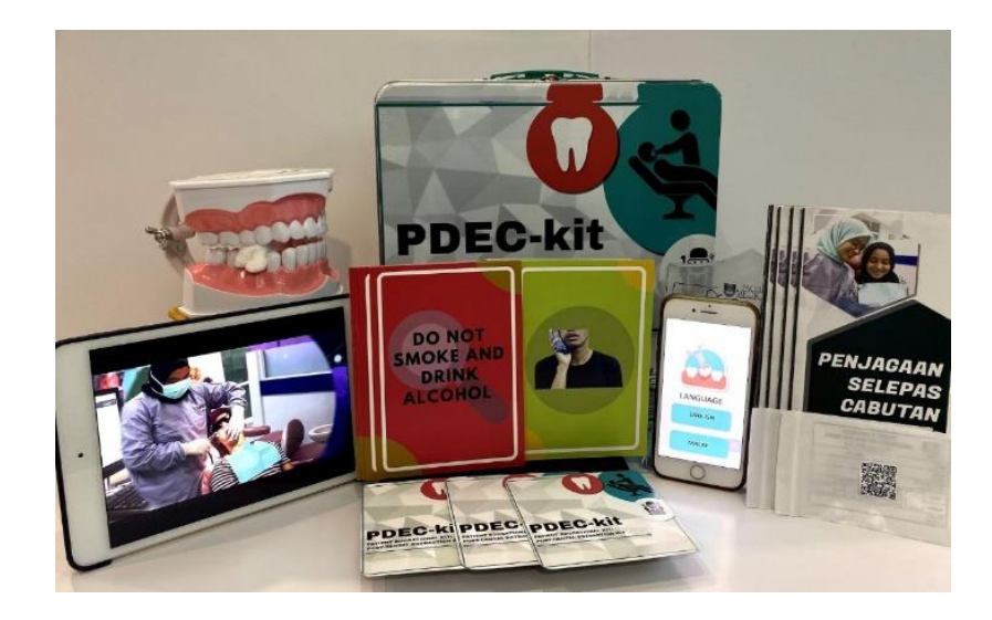
Figure 1: Patient educational kit: Post-Dental Extraction Care kit (PDEC-kit)

Subsequently, all participants were asked to answer a set of an online self-administered survey in Google Form. The survey consists of four parts including demographic profile, questions on their perception, and suggestions to improve the PDEC-kit. Additional questions about the market survey also are included to evaluate if they will purchase the kit if it is available in the market.