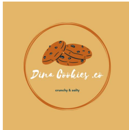
Figure 2.0 – Dinacookies.Co Logo

Dinacookies.co is an online business that is conducted at home. Essentially, this business is focused on one product which is homemade premium Sea Salt Chocolate Chip Cookies. Our focus location is at Port Dickson as the place is our hometown as well. Below is our logo and more detail about Dinacookies.co business.