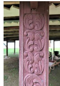
D: motif bunga kiambang