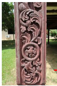
A: motif bunga kiambang & geometry (circle)