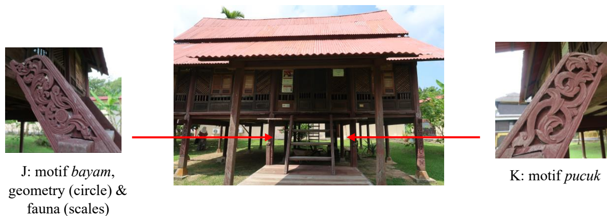
Figure 4. Motifs on House No 1(c)