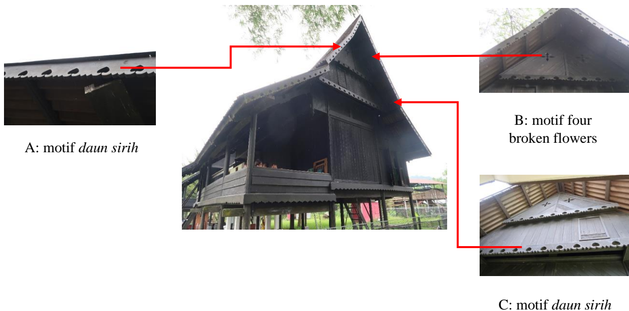
Figure 6. Motifs on House No 2

The categorisation of the motifs found on the selected houses consisted of flora, fauna, geometry, still life, and combination motifs. They do not only serve as mere aesthetics but also provide specific functional uses for the house owners. Rumah Tukang Kahar showed detailed motifs on the stilts and stairs as he was deemed as the Tukang raja (king's craftsman) due to his social standing. At the same time, Rumah Dato' Bangsa Balang displayed simpler floral motifs on the gable, barge board, and fascia board. The findings also revealed floral motifs to be the most prominent element in the art of woodcarving. Subsequently, in Malay woodcarving, the stimulus of the motifs was predominantly from the natural beauty of the surroundings, mainly from the local plants found in the near vicinity, such as Bunga kiambang , daun sirih and Bunga keladi bunting . Nature is one of the main determinants that has capacitated fellow craftsmen to manifest their imagination into visual narratives.