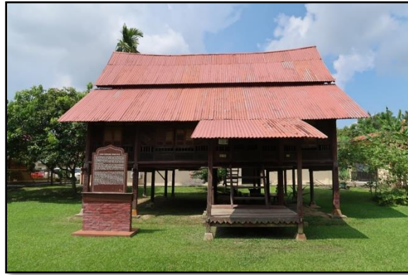
Figure 1. House No 1