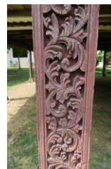
C: motif bayam