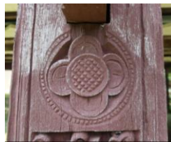
B: motif four broken flowers & geometry (square)