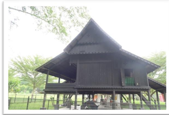
Figure 5. Motifs on House No 2