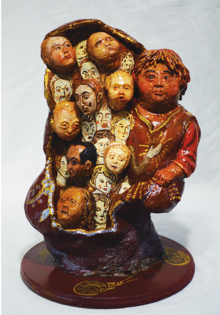
LUK SOCRATES Middle-Aged Man

Concrete sculpture H 11.8" L 7" W 2" Luke.The6th@gmail.com