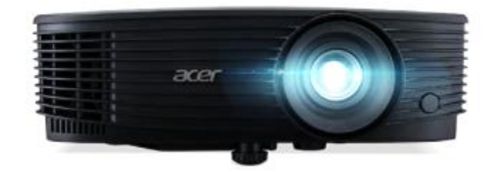
Figure 1 Acer's projector

I'll also provide some alternatives to the projector's drawbacks here.