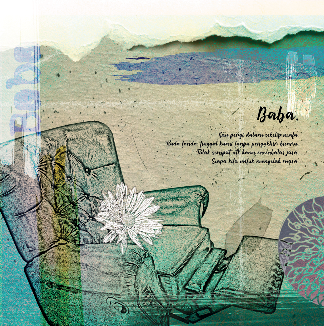
FARHANAH ABU SUJAK Untukmu Baba

Digital Image Manipulation 3' x 3' farha717@uitm.edu.my