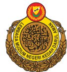
Lembaga Muzium Negeri Kedah