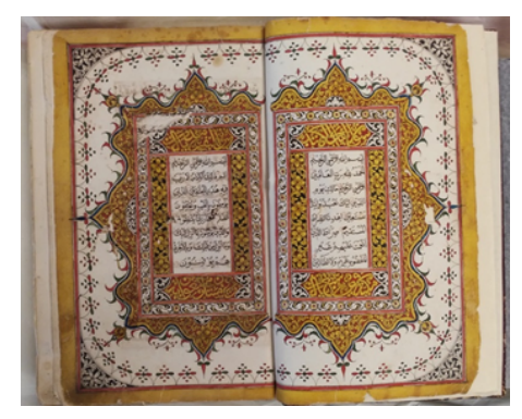
Figure 41: MSS 3238. Open page consist surah al-Fatihah verses 1-7 and early surah al-Baqarah verses 1-4 (National Library Kuala Lumpur)

Almost all Jawi manuscripts use paper imported from China, India, Persia, and Europe. But, several districts in the Javan uses material from a plant called Dluwang . When the arrival of Europeans around the 16th century AD, the activity of copying manuscripts took place more widely, during that era, most of the Al-Quran manuscripts were produced by using European-made paper with watermarks from Italy and other continental European companies. The pens used are from palm and bracken. There are also made the pen from the fur of animals such as geese, ducks, and eagles. However, this type is less used than the pen from the plant type. In terms of writing, Malay manuscripts use beautiful and structured calligraphy. The most common types of writing found in manuscripts especially the Al-Quran are the nasakh and thuluth styles. The decoration in the Quran and religious manuscripts is the culmination of the art of Malay manuscripts. The position of decorative art in the Quran is on the surrounding frame of the verse found on the front, middle, and end of the sheet. Particular patterns are placed mainly on the chapter or juzuk in the Quran. The design and ornaments on the frame develop according to the local district art style. (Plate 2.2 c)