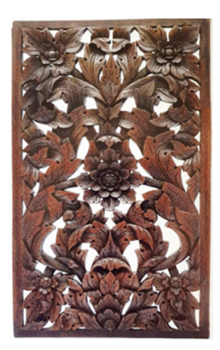
Figure 40: Wind Comb, Its function is for lighting and ventilation at the top of the wall. The motif used for the carving is bunga pepulut and batang cincang . The carving technique is Tebuk tembus bersilat . While the type of wood is Chengal . This complete pattern or Pola Lengkap carving derived from the state of Kelantan. It is now preserved and cared for by the Asian Art Museum. University of Malaya, Kuala Lumpur.

Sulur Bayung or Tendril refers to the decoration placed on the Malay architecture, jewelleries and utensil equipment. Typically, the tendrils are located at the end of an object or craft. For the the traditional Malay architecture, Sulur has a variety of names including Sayap layang-layang, Ekor Itik, Anjong Balla and Som. It is a decorative element found on the corner of the roof. The concept of tendrils pattern must be smooth, gentleness and refined formation. The tendril has provided with disciplined of wave motion. The movement of the motif and pattern has been studied and projected in very proper, polite and well organized (Figure 40). Awan Larat are created from the natural elements of living things such as whirlpools, waves, clouds, animal tails, fish fins and so on. But, due to the manifestation of Islam that is strong enough to affect the community, so elements and plants most often referred to by the artist. Tendril or Sulur at wood carving must be formed in a beautiful, soft and controlled form. In order to give birth to beauty and tenderness. The empty spaces that are the part without carving must be almost the same width and ratio as the carved part. The tendrils or Sulur is the pattern most honoured in appreciation of Malay classical carving style.