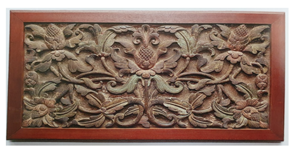
Figure 39: The complete pattern known as a Pola Lengkap, usually is the most beautiful arrangement of wood carving. It is contained the complete section of plants, such as blossom flower, stem, thick, leaf, tendrils and fruit. the Asian Art Museum. University of Malaya, Kuala Lumpur.

Sulur Bayung or Tendril refers to the decoration placed on the Malay architecture, jewelleries and utensil equipment. Typically, the tendrils are located at the end of an object or craft. For the the traditional Malay architecture, Sulur has a variety of names including Sayap layang-layang, Ekor Itik, Anjong Balla and Som. It is a decorative element found on the corner of the roof. The concept of tendrils pattern must be smooth, gentleness and refined formation. The tendril has provided with disciplined of wave motion. The movement of the motif and pattern has been studied and projected in very proper, polite and well organized (Figure 40). Awan Larat are created from the natural elements of living things such as whirlpools, waves, clouds, animal tails, fish fins and so on. But, due to the manifestation of Islam that is strong enough to affect the community, so elements and plants most often referred to by the artist. Tendril or Sulur at wood carving must be formed in a beautiful, soft and controlled form. In order to give birth to beauty and tenderness. The empty spaces that are the part without carving must be almost the same width and ratio as the carved part. The tendrils or Sulur is the pattern most honoured in appreciation of Malay classical carving style.