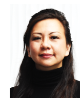
FIONA WONG E CHIONG Eclectic Façade

This artwork is inspired by the artist's own research endeavours during her Masters studies which looked at the evolution of the shophouse façade in the late nineteenth and early twentieth century Malaya, and which prompted her to travel to many towns around the peninsula and photographed the different shophouse typology since twelve years ago. The artist also writes and publishes papers that call out on the conservation and preservation of these eclectic shophouses in the country.