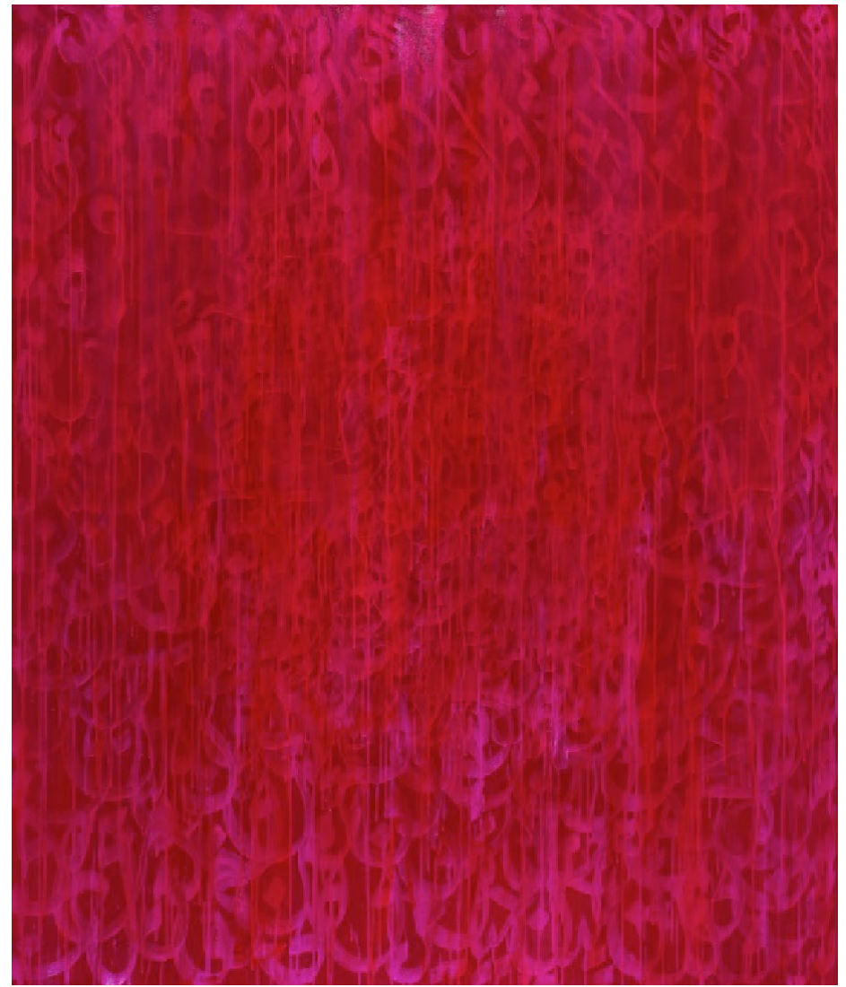
Figure 2: Duaa Alashari, The Story of Love, Acrylic on canyas, 60x 72 inches, 2015.

I used this poem as the basis for my work to represent my love for calligraphy and how the love of this art has changed my whole life. Using the words of the poem as a starting point, through the process of repetition, the word loses its meaning. By transforming its legibility, the word moves beyond language. The calligraphic marks and the layers of intense and transparent washes of colours of paint that cover the surface of the painting give the work a metamorphic subtlety and profundity regarding both spiritual and sublime. The multidimensional sense of space in The Story of Love is achieved by using superimposed layers of calligraphic marks. Equally important to achieving this is a sense of space. However, space is designed, so the viewer's perceptual shift of the work ranges from infinite to finite to facilitate meditation. In The Story of Love , there is both an invitation into the space of that space. To enhance their contemplative theme, I combine light and dark areas to strongly contrast the value in a way that encourages the viewer to see the painting as a symbolic progression of thought. Low resolution and merging colours nod to the infinite, while the surface is asserted over these colours with striking marks.