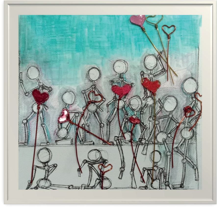
series 1: Exhausted