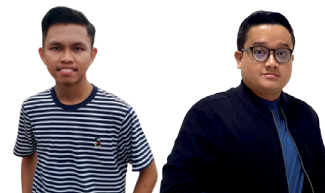
MUHAMMAD ZAIDI ZAINAL ABIDIN MUHAMMAD FALIHIN JASMI Desolate

Paper Collage 430 mm x 430 mm falihin@uitm.edu.my