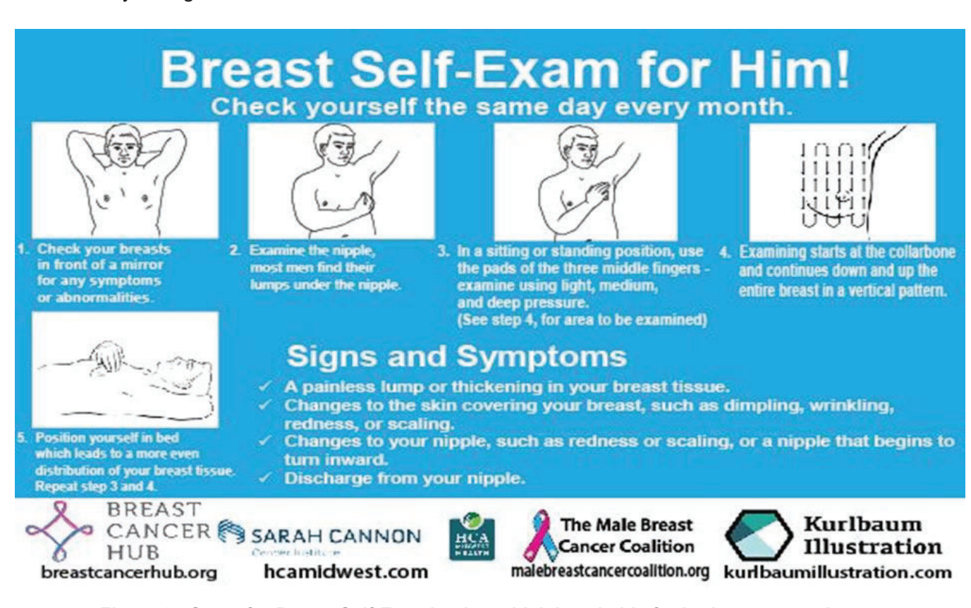
Figure 3: Steps for Breast Self-Examination which is suitable for both women and men.

Fortunately for all of us, there is one solution that can help us to reduce the risk and cost of breast cancer. One of the easiest and cheapest approaches to help women and not to forget men is by practicing breast self-examination. A study done in the United Kingdom has found that about 27% of breast cancer is detected by breast self-examination alone and cancer detected is at an early stage where better prognosis happens in women (Micah et al, 2021). Women and men are advised to begin practicing breast self-examination at the age of 20 (Marie. A, et al, 2009). Thus, let have a look at how to do this examination. The examination required 5 simple steps as shown in Figure 3 and you may fix the same date every month, try to avoid the date near to your menstrual cycle as your breast might be slightly tender at this time (Breast Cancer.org,2020). The best time to do the examination is on 3 to 5 days after your menstrual since the breast is not as tender or lumpy. For men or women who menopause, you can fix any date of the month. Fixing the date will help you keep track of any change that occurs from one breast examination to the next examination.