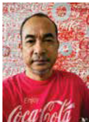
JAMIL MAT ISA Black Roses on Green

In this current series, selected flowers such as roses, jasmine, orchid and others are used as metaphors. Black Roses on Green (2020) is one of the new series produced to respond and reflect on the current phenomenon, pandemic C-19.